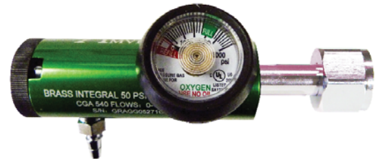
Click-Style Regulator with Nut & Nipple