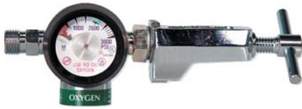
Compact Regulator with Yoke