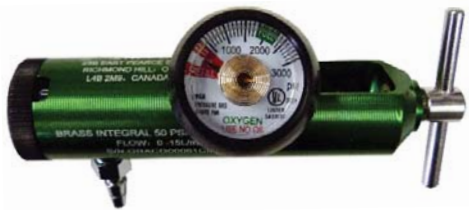
Click-Style Regulator with Yoke