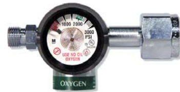
Compact Regulator with Nut & Nipple